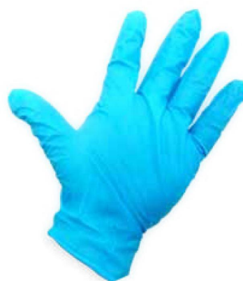
D670 Nitrile Disposable Gloves