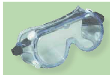
1621 Safety Goggles