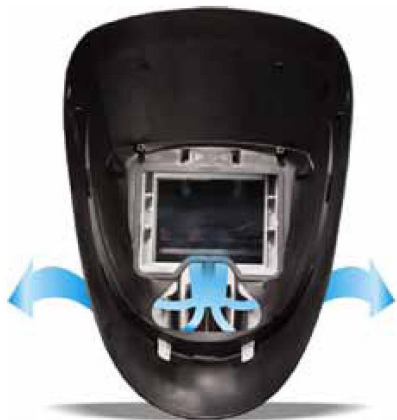
PS100 Passive Welding Shield